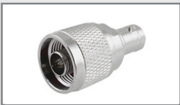
Item: CNGT11 RF adapter, N-M/BNC-F