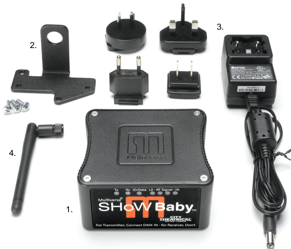
Figure 3: What's Included