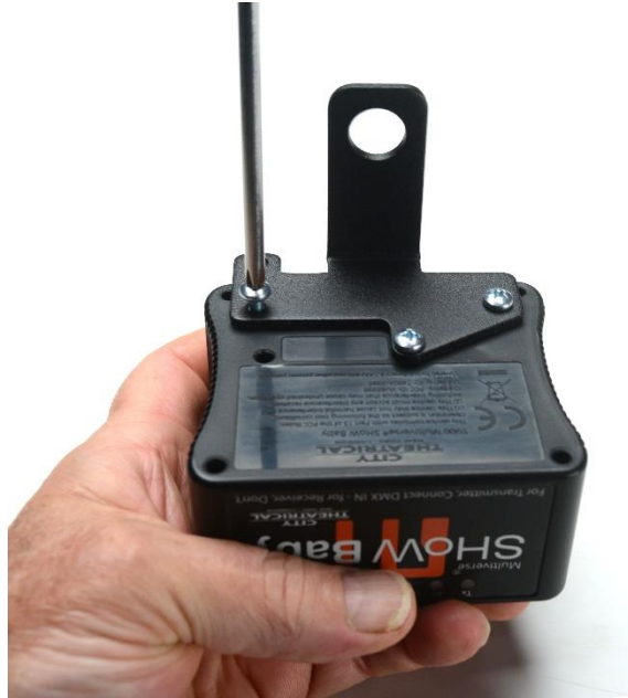
Figure 2: Attaching the Mounting Bracket

Mount the Bracket on the Multiverse SHoW Baby using the three provided 8-32 x ½" pan head Philips screws.