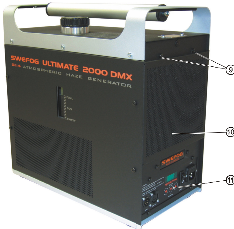
Ultimate 2000 DMX front & left side